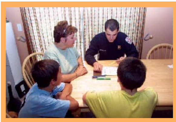
Figure 3: A family makes a home escape plan.

A home escape plan is your way out of your home if you have a fire. After you plan your escape, all family members should practice the escape plan every six months. The more you practice your escape plan, the more prepared you will be to take action in an emergency.