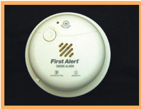
Figure 1: A smoke alarm for people who are blind or have low vision. This alarm comes with a 10-year battery and is tested and silenced by remote control.

You need at least one smoke alarm outside every sleeping area and on every level of your home. The most dangerous fires occur when you are sleeping. The smoke alarm should detect the smoke before it reaches your sleeping area and wake you up.