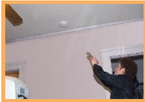
Figure 2: Point the remote toward the alarm.

To test the alarm, point the remote control at it. Hold down the volume or the channel button for 3 to 5 seconds (see Figure 2).