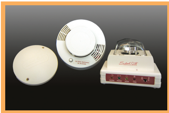
Figure 1: A smoke alarm for people who are deaf.

You need at least one smoke alarm outside every sleeping area and on every level of your home. The most dangerous fires occur when you are sleeping. The smoke alarm should detect the smoke before it reaches your sleeping area and wake you up.