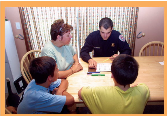
Figure 2: A family makes a home escape plan.

A home escape plan is your way out of your home if you have a fire. After you plan your escape, all family members should practice the escape plan every six months. The more you practice your escape plan, the more prepared you will be to take action in an emergency.