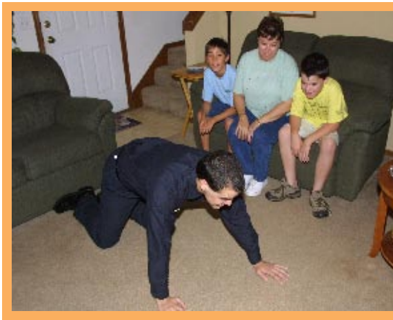
Figure 4: Practice crawling to get under smoke.

If the door does not feel hot, open it with caution. There still may be smoke and heat on the other side. If you open the door and find smoke or heat, close the door, and use your second way out. If the path to the outside is clear of smoke, or if you can crawl under the smoke, move quickly to the exit (see Figure 4).